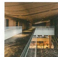
Coastal Cinema by One Plus Partnership 'Dynamic Interface between coast and land'