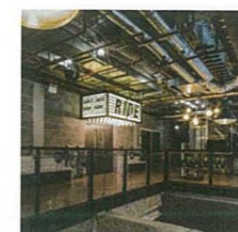
Mandarin Palace Clubhouse by PAL Design Consultants 'A beautifully executed interpretation of the traditional scroll form'