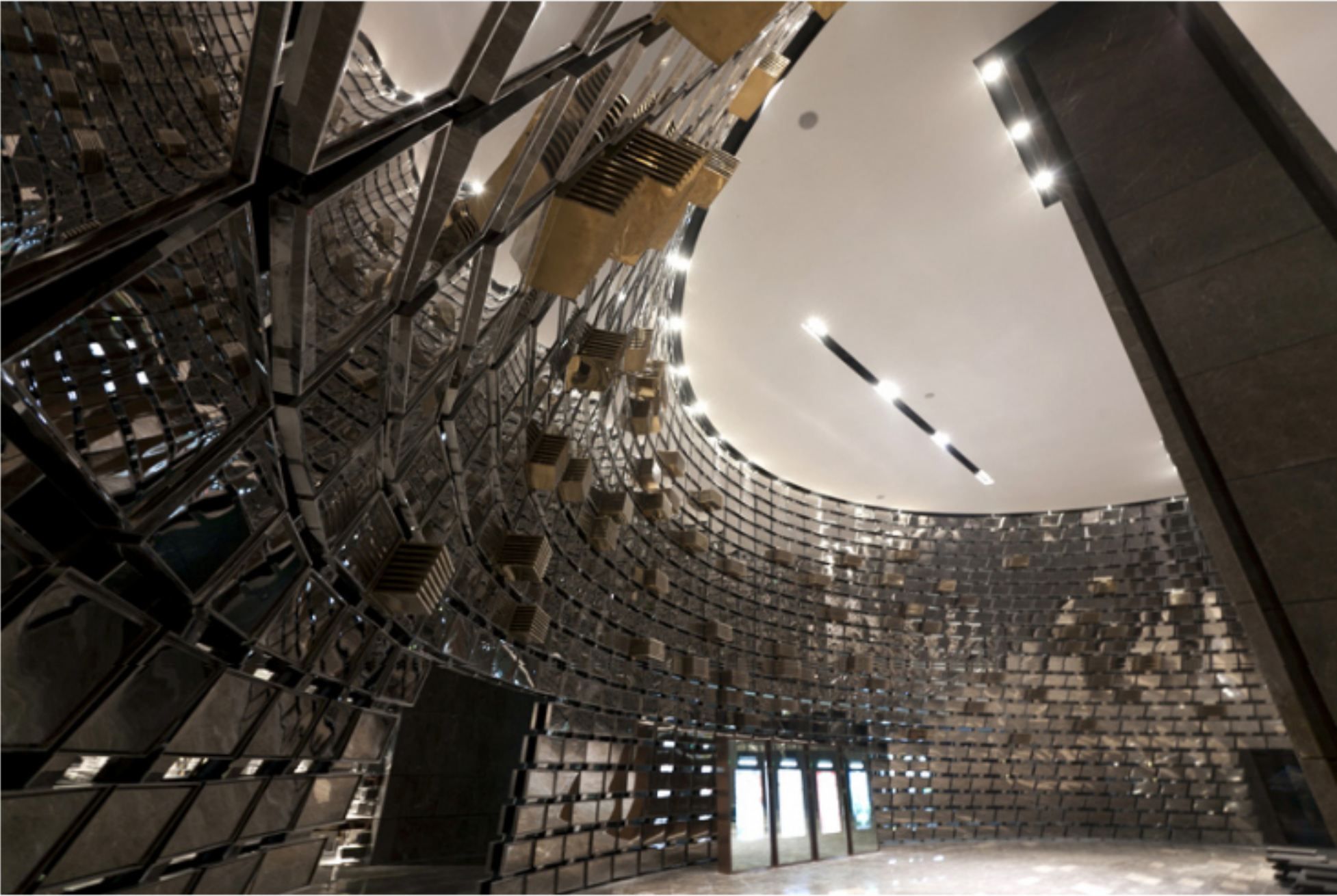
'wuhan pixel box cinema' by one plus partnership in wuhan, china

hong-kong based practice one plus partnership (ajax law ling kit, virginia lung) has sent us images of 'wuhan pixel box cinema', a multiplex theatre in wuhan, china. treating the basic element of a tiny pixel as the basis of the design, the project seeks to fully immerse the visitors into the realm of motion pictures by creating a visually-arresting motif out of the square-shaped units.