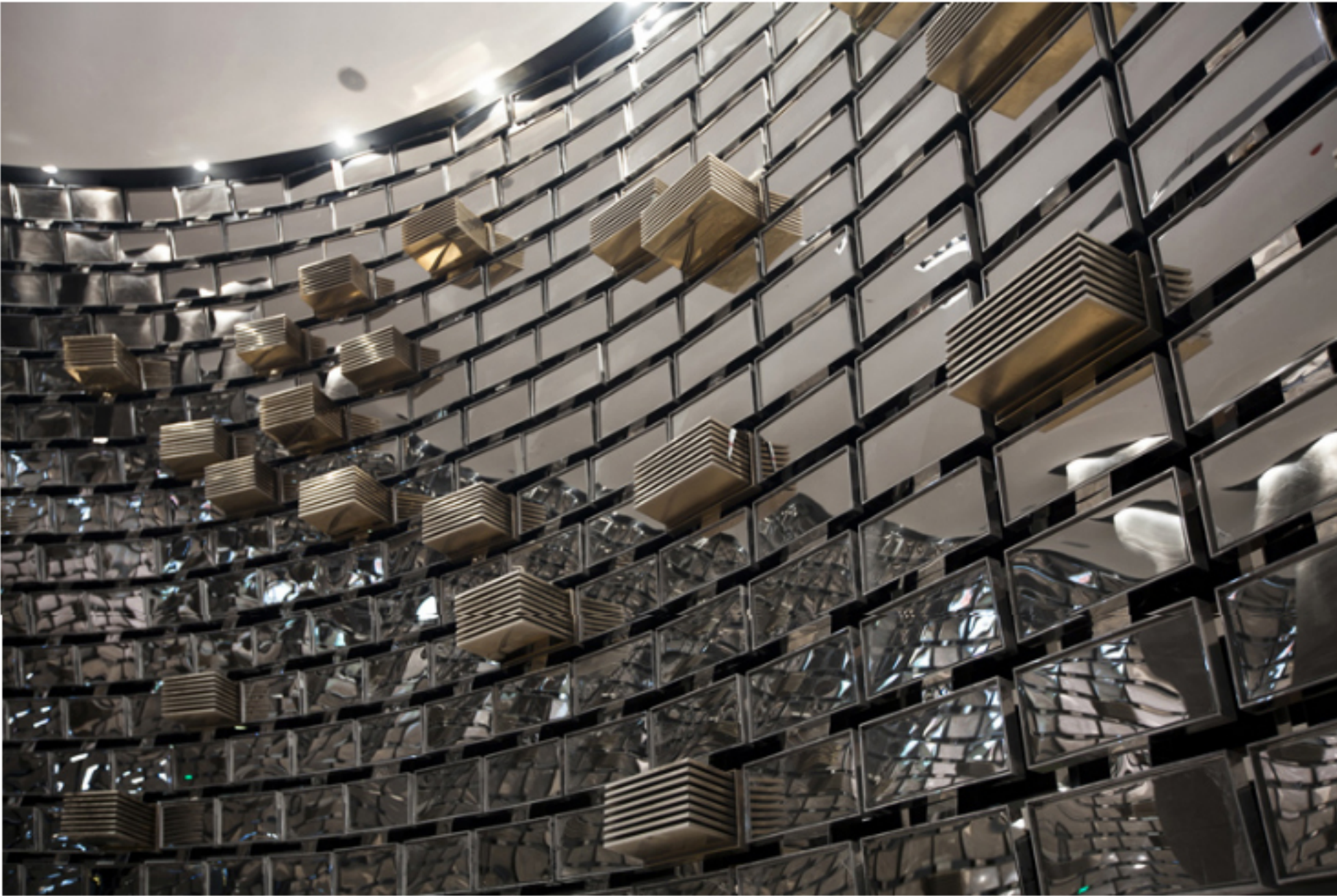
interior of stainless steel envelope

hong-kong based practice one plus partnership (ajax law ling kit, virginia lung) has sent us images of 'wuhan pixel box cinema', a multiplex theatre in wuhan, china. treating the basic element of a tiny pixel as the basis of the design, the project seeks to fully immerse the visitors into the realm of motion pictures by creating a visually-arresting motif out of the square-shaped units.