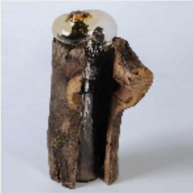
marco merkel : tree trunk glassblowing molds