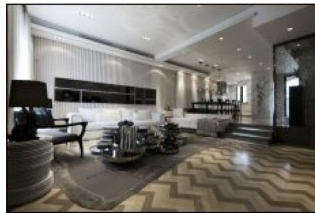
Shanghai Parc Four Seasons Show House

Hong Kong Trader targets key decision-makers in business and public life. Each week, the award-winning online publication presents the developments and insights that matter, with a focus on dynamic Hong Kong and the rapidly evolving Chinese mainland. Hong Kong Trader also features a customised news section to meet the needs of individual readers.